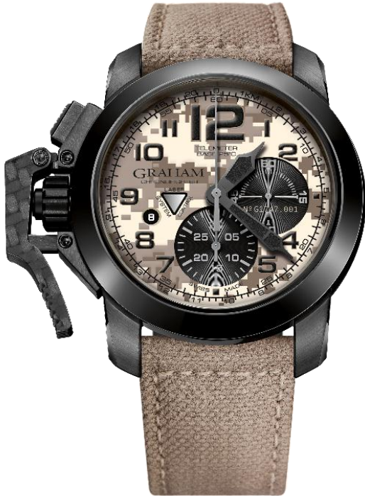
2CCAUE05A Ø 47mm steel with black PVD case Beige-shaded digital camouflage Beige canvas strap