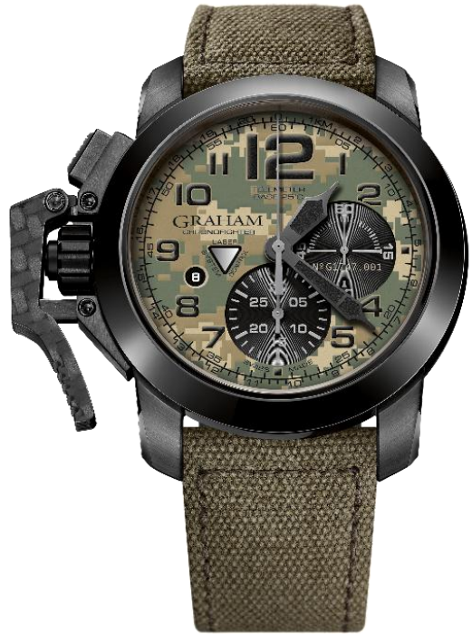
2CCAUG05A Ø 47mm steel with black PVD case Green-shaded digital camouflage dial Green canvas strap